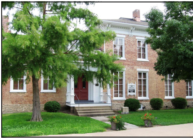
Historic Lee-Baker-Hodges House